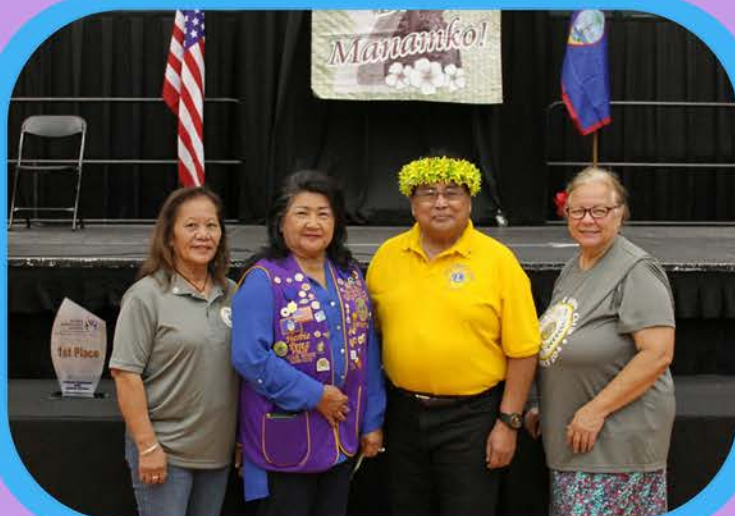
Lions Club District 204