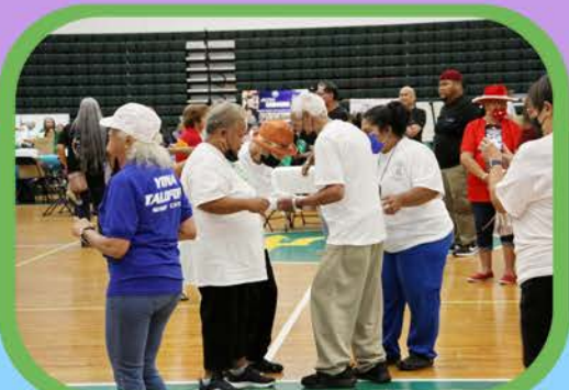
Adult Day Care clients enjoy themselves during the Cha'Cha' Freeze activity and took 2nd place