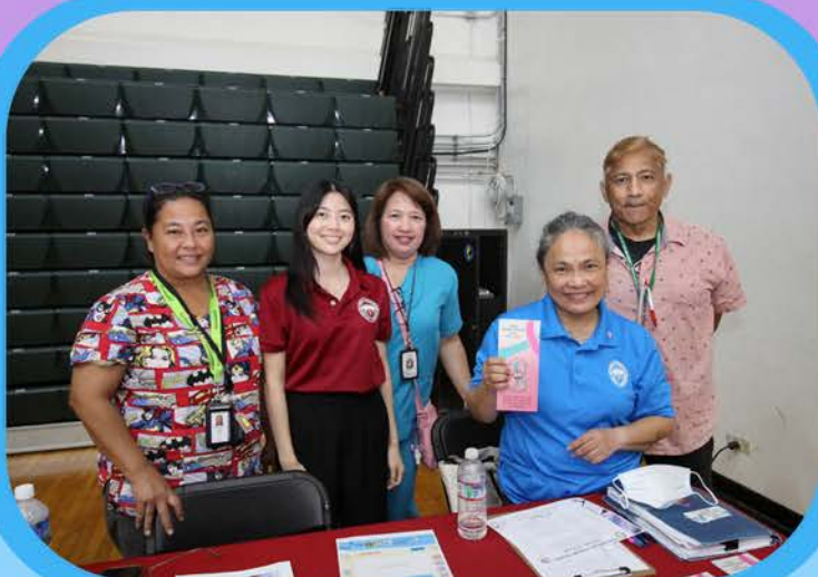
DPHSS Health Disparities Program

Special Thanks to our Sponsors, Exhibitors, and Volunteers who helped make the 2023 Huegon Manamko - Senior Games, Vaccine & Booster Clinic a huge success!