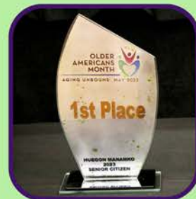
1st Place Tamuning Senior Citizens Center