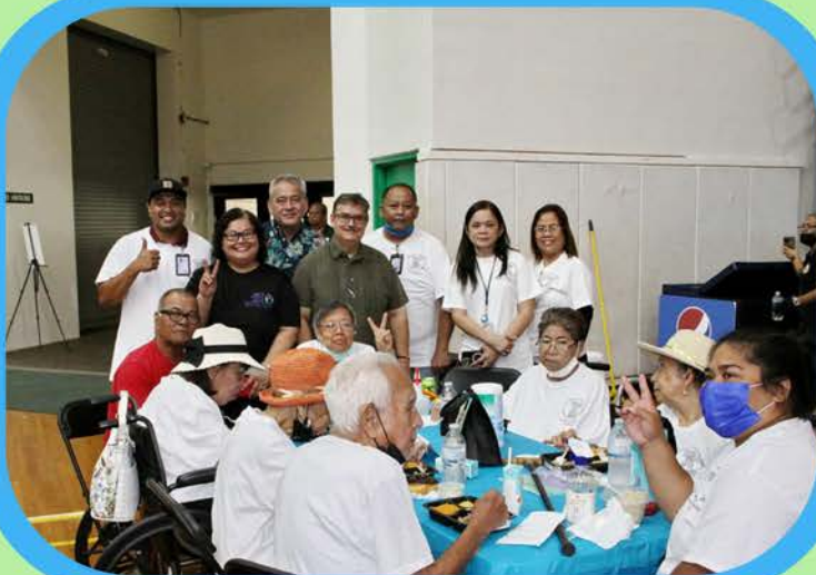
Adult Day Care, Mayors' Council of Guam