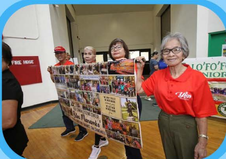
Yigo Senior Citizens Center