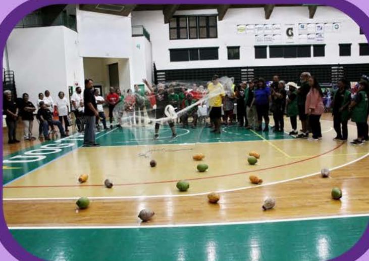
Talaya (Fish Net) Throw

Sponsored by Adult Day Care Program with assistance from the Division of Senior Citizens