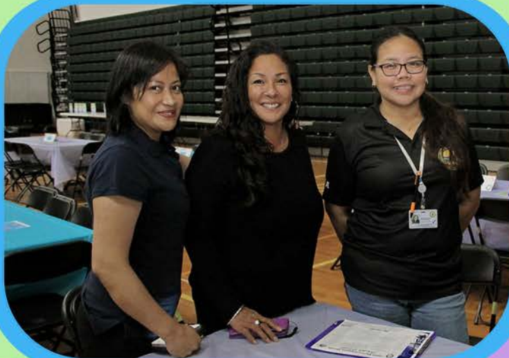
Senior Center Operations, Mayors' Council of Guam