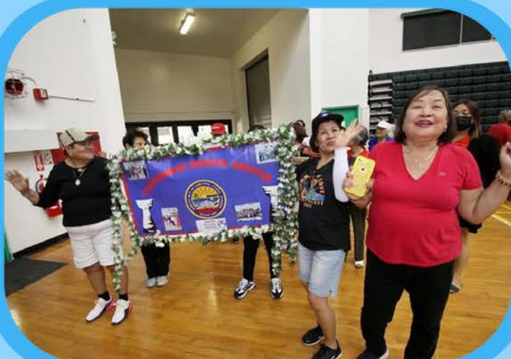
Tamuning Senior Citizens Center