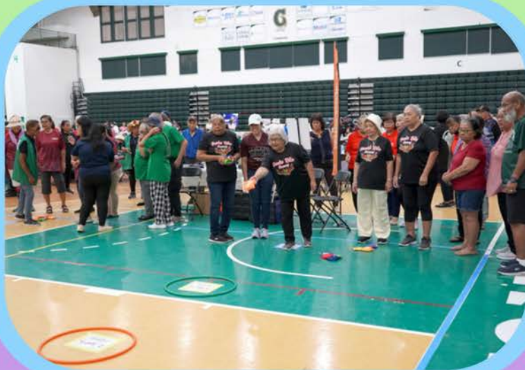
Rice Bag Throw

Sponsored by the Family and Consumer Science (KEA Program and SNAP-Ed & ESLS), University of Guam