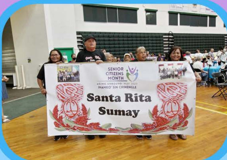
Santa Rita Senior Citizens Center