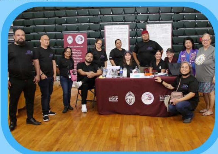
Division of Senior Citizens

Funded by Vac5 COVID19 Vaccine Access funds (2101GUVAC5-00) and DPHSS, Division of Senior Citizens