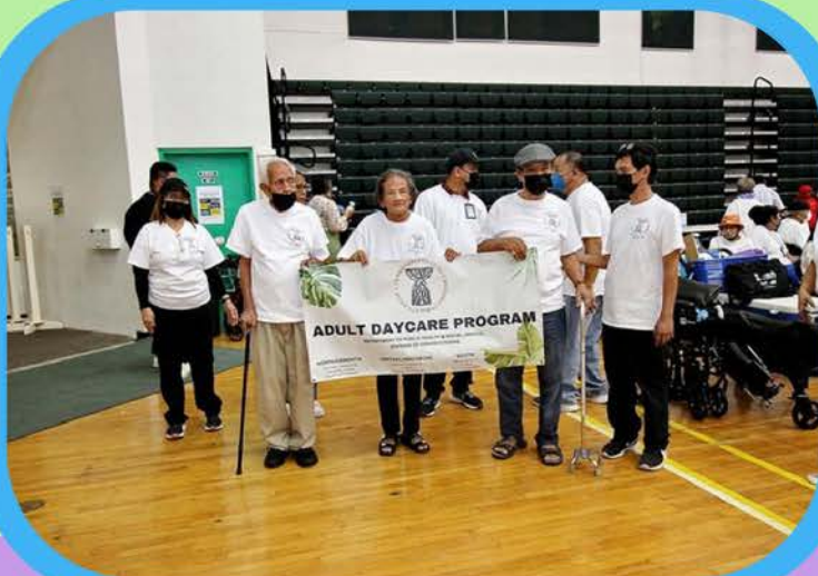
Adult Day Care