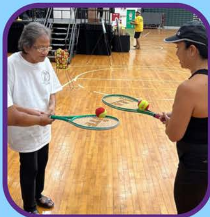
Adult Day Care client learns useful Tennis Skills & Exercises provided by Ninete Tennis Community Association (NTCA)