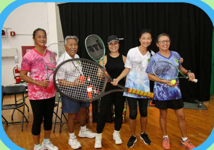
Ninete Tennis Community Association (NTCA)