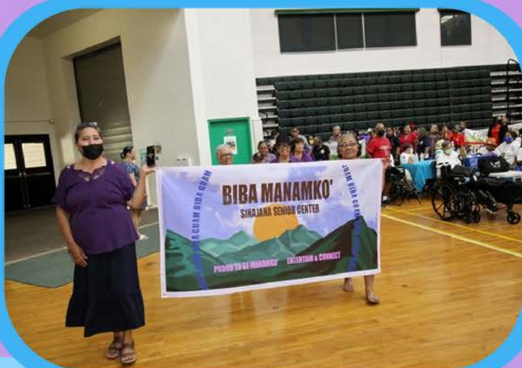
Sinajana Senior Citizens Center