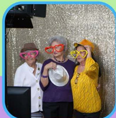
GouGuam Association of Retired Persons (GGARP) representatives captures memories with the photo booth