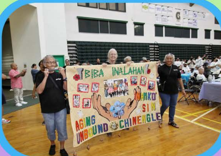
Inalajan Senior Citizens Center