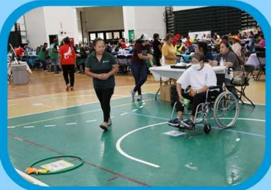
Adult Day Care client scores a point during the Rice bag Throw activity