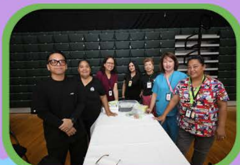
DPHSS Immunization & Health Disparities Program Nurses and Staff get ready for the Vaccine & Booster Clinic

This year's Huegon Manamko - Senior Games was also the first year that offered the Vaccine & Booster Clinic alongside all the activities