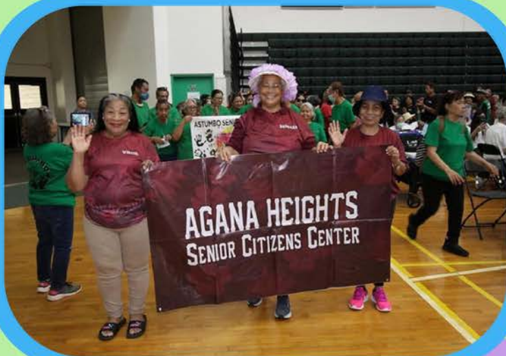
Agana Heights Senior Citizens Center