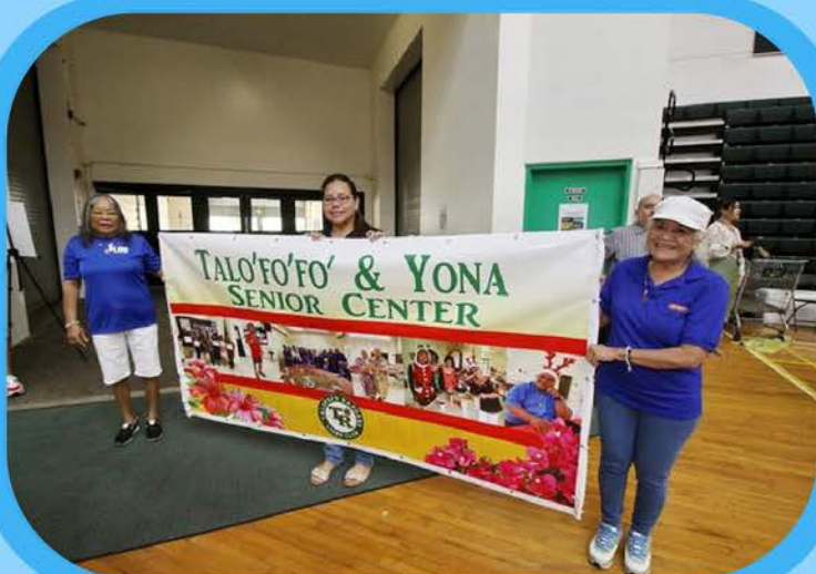
Yona / Talofofo Senior Citizens Center