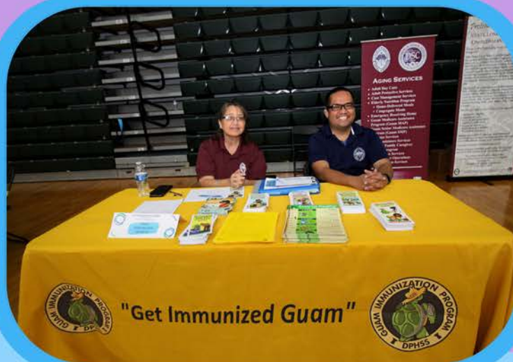
DPHSS Immunization Program