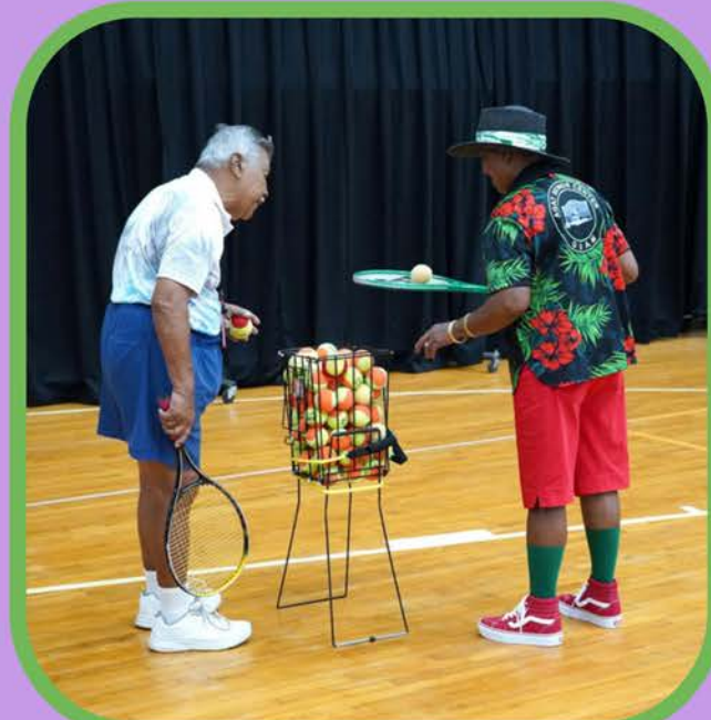
Tennis Skills & Exercises for Seniors by Seniors Sponsored by Ninete Tennis Community Association (NTCA)

Sponsored by the Family and Consumer Science (KEA Program and SNAP-Ed & ESLS), University of Guam