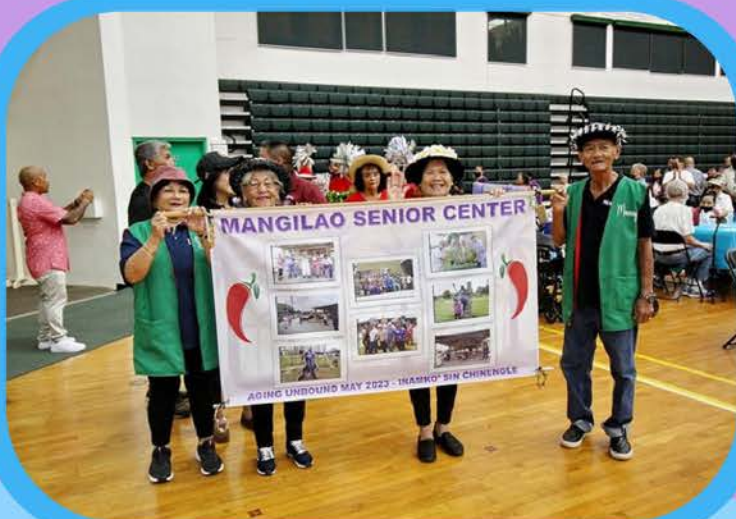
Mangilao Senior Citizens Center