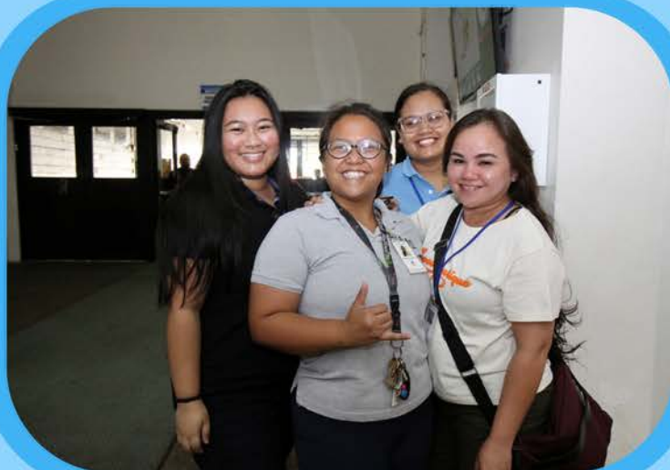
Volunteers from Health Services of the Pacific Case Management Service