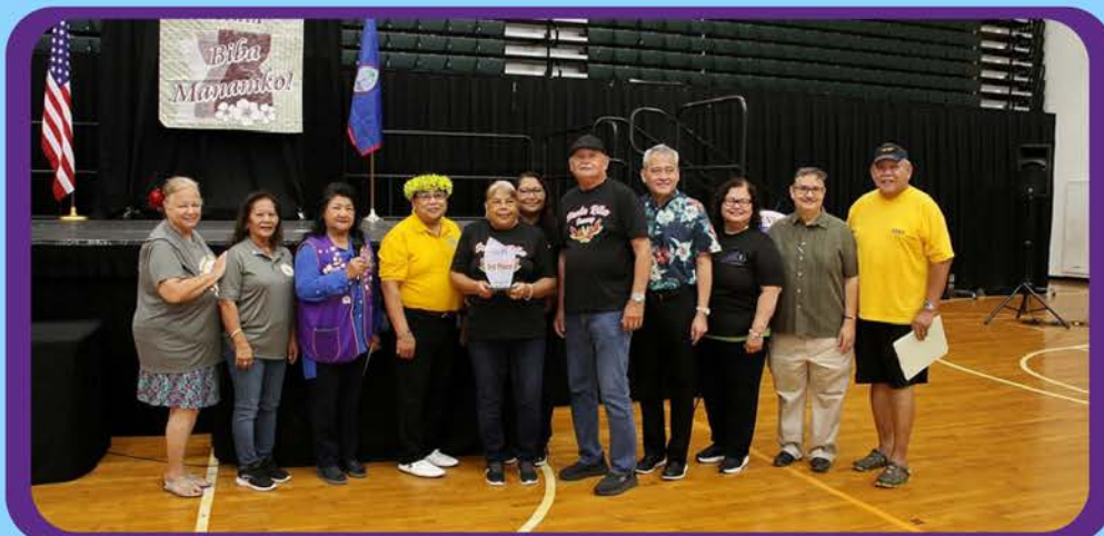
3rd Place Santa Rita Senior Citizens Center