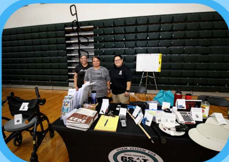
Guam CEDDERS - Guam System for Assistive Technology, University of Guam