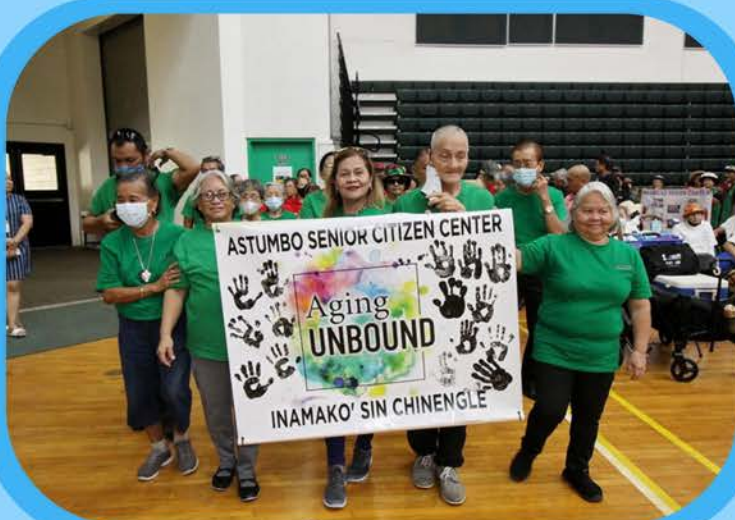
Astumbo Senior Citizens Center