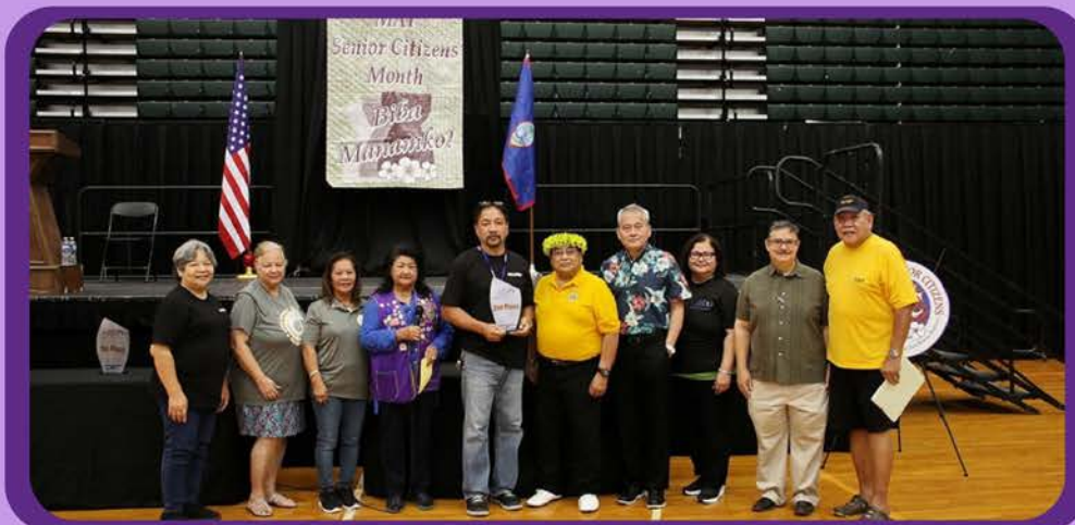
2nd Place Inalajan Senior Citizens Center