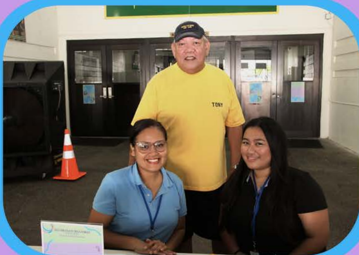
Senior Center Operations, Mayors' Council of Guam and Health Services of the Pacific