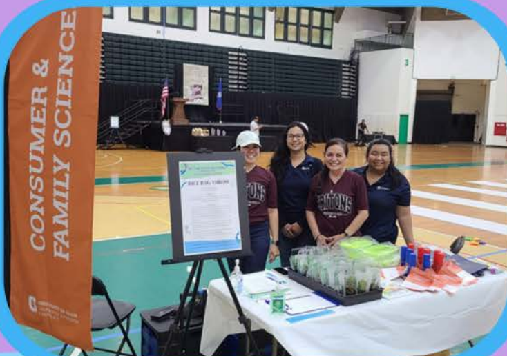
Consumer & Family Science (KEA Program and SNAP-Ed & ESLs), University of Guam