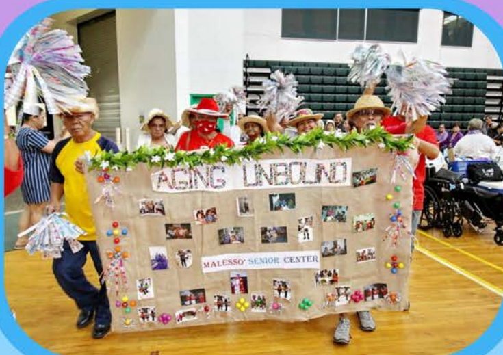
Malesso' Senior Citizens Center