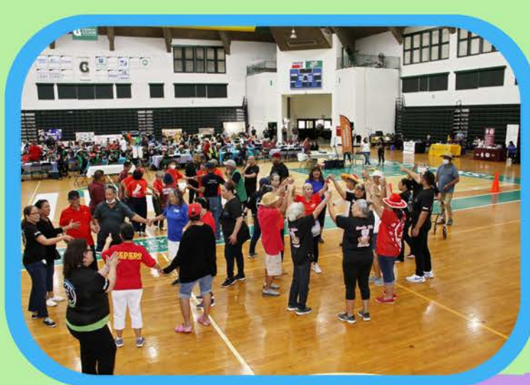
The Gathering Game Sponsored by the Division of Senior Citizens

The games included the Gathering Game, Rice Bag Throw, Tennis Skills & Exercises for Seniors by Seniors, Egg Toss, and Golf Putt