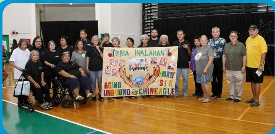
Inalåjan Senior Citizens Center wins 1st Place for the Parade of Center Banners competition

The Division of Senior Citizens, Department of Public Health and Social Services, in partnership with the Mayors' Council of Guam and the 2023 Senior Citizens Month Central Planning Committee, hosted the 2023 Huegon Manamko - Senior Games, Vaccine & Booster Clinic. This marked the return of this Senior Games event, which was last hosted in 2019.