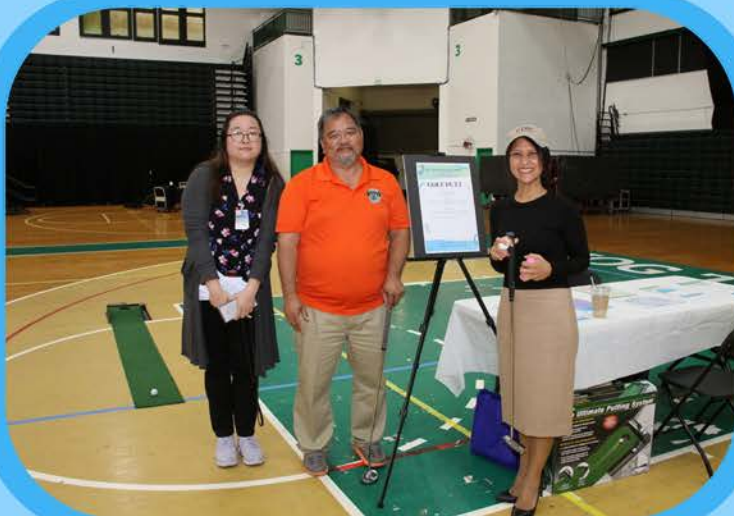
Elder Justice Center, Legal Assistance Service Public Defender Service Corporation