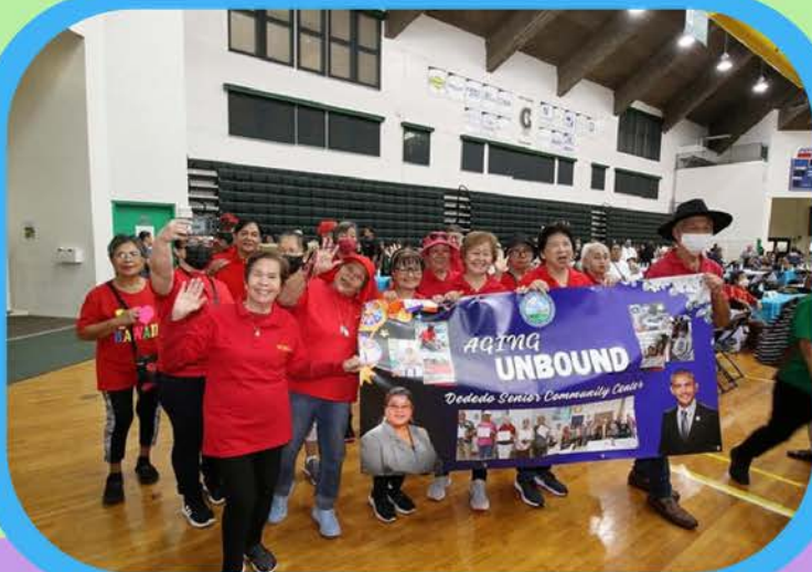
Dededo Senior Citizens Center