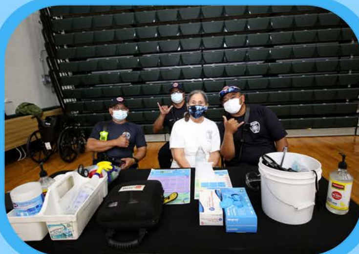
Guam Fire Department